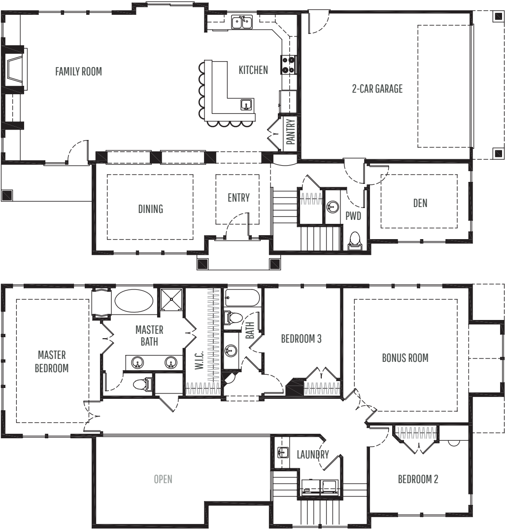
UPPER LEVEL (BOTTOM)